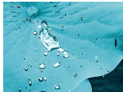
THE LOTUS EFFECT is a special case of water repelling, or hydrophobic, behavior

A common case in nature is the "lotus effect", where water droplets can be seen on the surface of a lotus leaf due to its hydrophobicity. Hydrophobic coatings have high water contact angles, above 90 degrees. The self-cleaning coatings are usually superhydrophobic as their water contact angle is greater than 150°. These surfaces are highly water repellent and water tends to form spherical droplets that roll away from the surface, carrying dirt away. It is well-known that contact angle is determined by both, the chemical and topographical properties of a surface. A superhydrophobic surface can be obtained only if the hydrophobic surface is roughened on the micro and nanometer scales. Therefore, the efficiency of a self-cleaning coating is dependent on the roughness and chemical composition of the surface and dirt particle adhesion to water droplet. These surface properties can be assessed using an optical tensiometer.